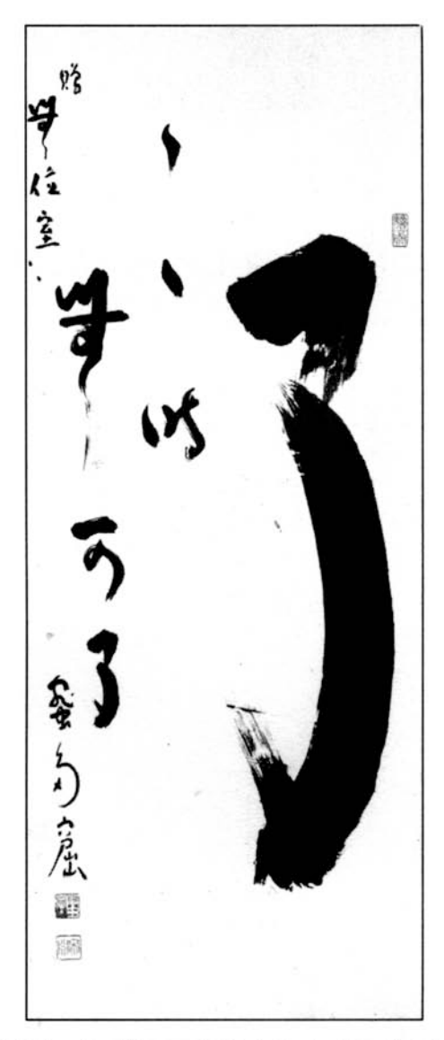
Finished, finished—when it is completely finished—there is nothing to finish