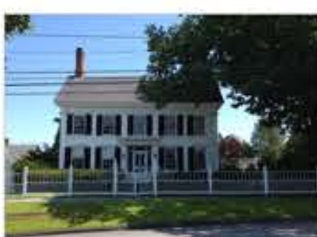
The Harriet Beecher Stowe House, seen in summer 2014.

Open the timeline in a full screen window »